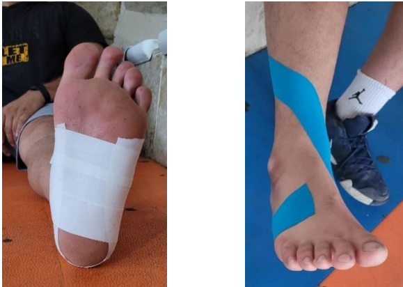
Figure 3. Navicular Sling Kinesio taping (right) and Low-Dye taping (left)

A rigid white zinc oxide tape was used for this procedure. During the application, the subject positioned the ankle in a neutral alignment. An anchor strip was first applied, extending from the medial aspect of the head of the first metatarsal joint, passing under the medial malleolus, and wrapping around the heel. The tape then continued beneath the lateral malleolus toward the lateral aspect of the head of the fifth metatarsal joint (Figure 3, left). Subsequently, supporting strips were applied across the plantar surface of the foot, running parallel from lateral to medial, and attaching to the anchor on each side. Depending on the size of the participant’s foot, approximately five to six strips were used to fully cover the metatarsal region of the sole (12, 13).