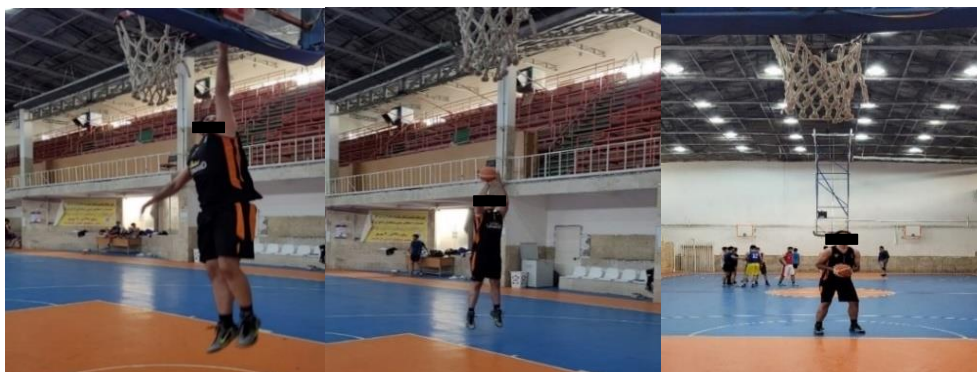
Figure 2. Skill tests in basketball: Layup (left), jump shot (middle), and free throw (right)

Low-Dye Taping: The Low-Dye taping technique is an effective method for increasing navicular height and correcting an overpronated foot or flexible pes planus (13).