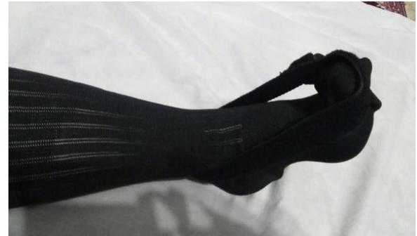
Figure 1. Strassburg Sock™ Night Splint

The Strassburg Sock™ Night Splint (Germany) used in the present study is a sock consisting of 80% nylon and 20% Lycra (an elastic material). This orthosis covers from the tibial tuberosity and extends to the end of the toes and has two bands, one at the calf area and the other at the tip of the toes, which helps keep the foot in proper position during the use of the splint (Figure 1).